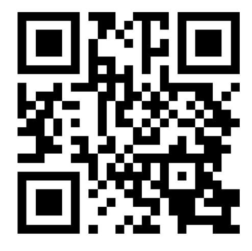
Scan QR Code

20% Discount Code for GFDC users if you purchase on the Cambridge site: CGED2021